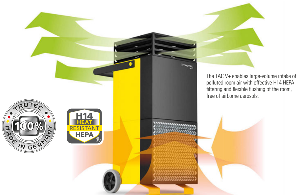
The TAC V+ enables large-volume intake of polluted room air with effective H14 HEPA filtering and flexible flushing of the room, free of airborne aerosols.

By installing several TAC V+, clean air lock areas can be set up as low-aerosol transfer, stay or waiting zones for your customers and employees!